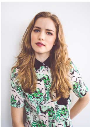
Willa Fitzgerald Meg March in Little Women